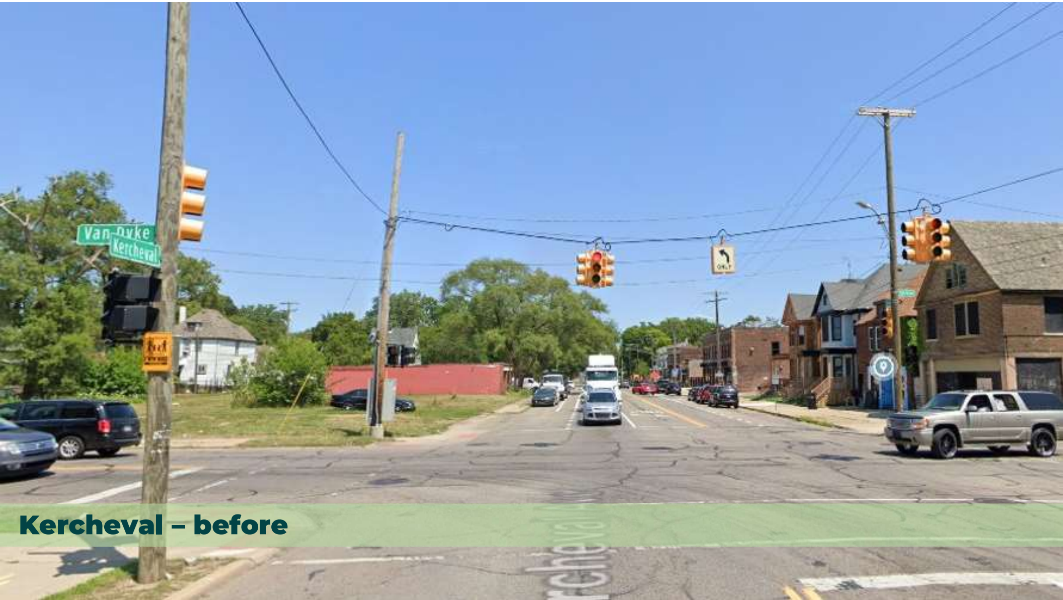
Kercheval – before