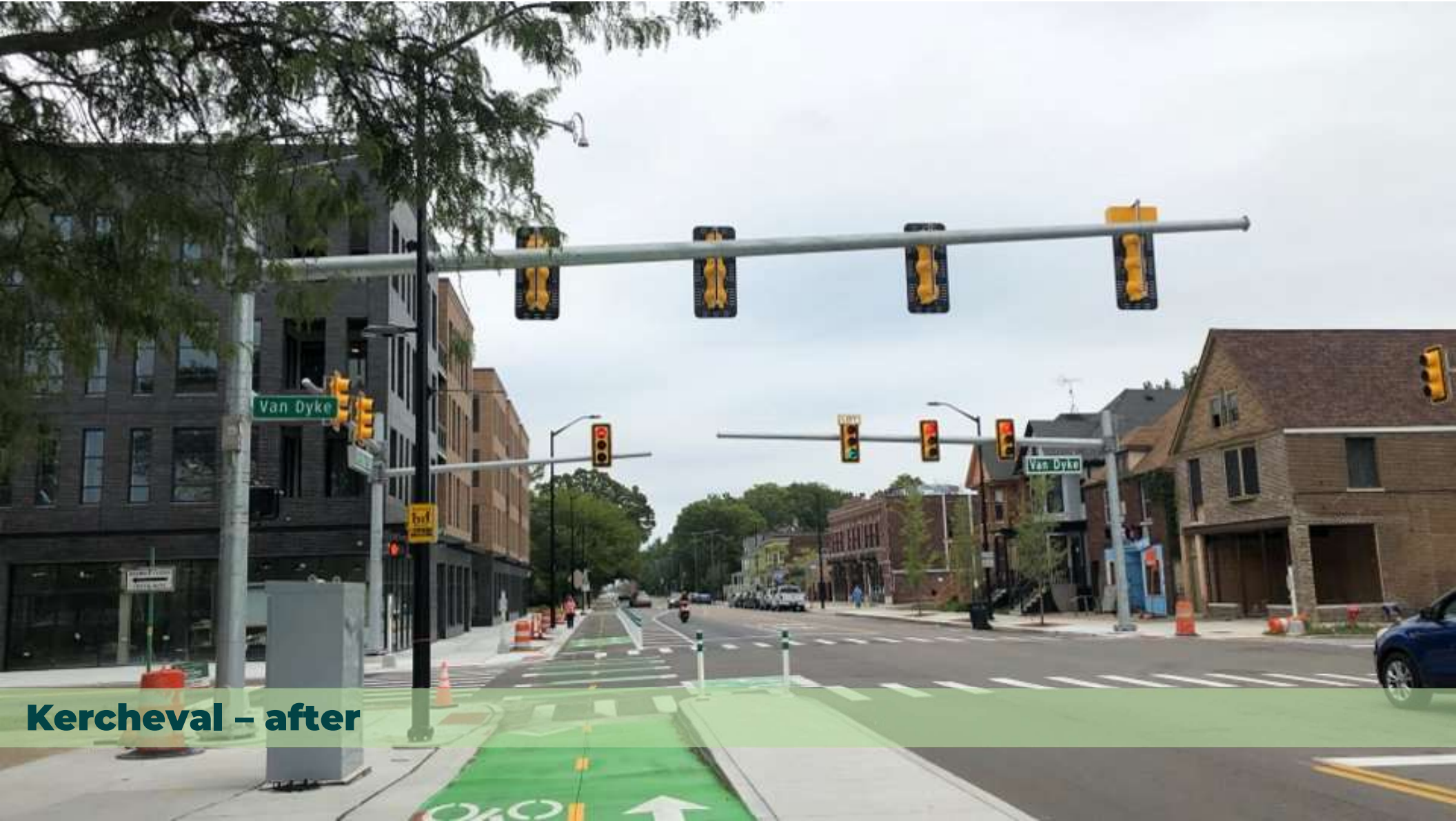
Kercheval – after