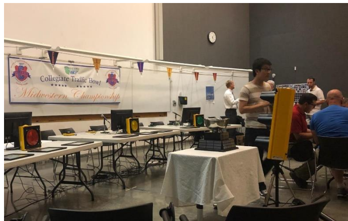
UWM at the Midwest District Traffic Bowl

We also hosted a group of speakers from RS&H, a national civil engineering firm. Their presentation was primarily focused on road construction. This presentation also doubled as a recruiting event for the