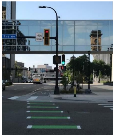
Washington Avenue Cycle Track

Complementing the technical sessions, the annual collegiate Grand Championship Traffic Bowl did not disappoint! Nine universities competed to the final round composed of the University of South Florida, Penn State University, and Texas A&M University. It was an exciting final round with all teams still in it going into Final Jeopardy. In the end, South Florida came out on top to win their first Traffic Bowl Grand Championship. It was amazing to see the knowledge and dedication these college students showed. For the final night there was a reception at Brit’s Pub, a British-themed bar with an established lawn bowling league.