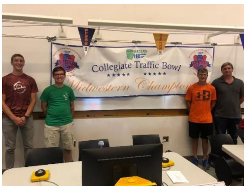
Fall 2018 ITE Student Leadership Conference