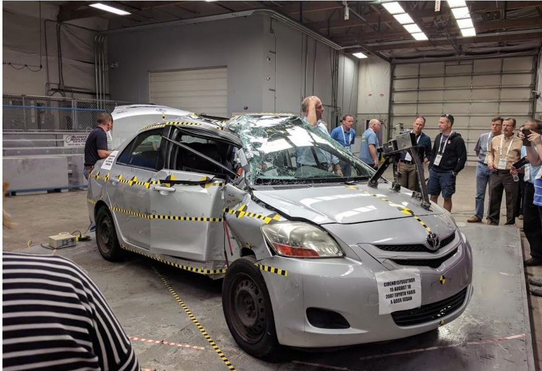
Students Attended Crash Test at the Crash Lab in Milwaukee

This past year has been filled with many conferences and symposiums for our student chapter. Some we have gone just to learn and deepen our understanding, while at many several of our students have had the opportunity to showcase their research. Some of the conferences we have attended this year have been the annual Transportation Research Board meeting in Washington, D.C. where we attended the ITE Student Reception and several students presented their latest research, the SAFER-SIM symposium for traffic simulation, the Traffic Records Forum in Milwaukee where students went on a tour of the Harley Davidson museum and saw a crash test at the Crash Lab (shown below), and the Forum on the Impact of Vehicle Technologies and Automation on Users in Iowa City, IA this November.