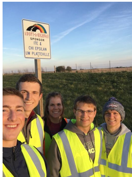
ITE Adopt-A-Highway Clean-Up