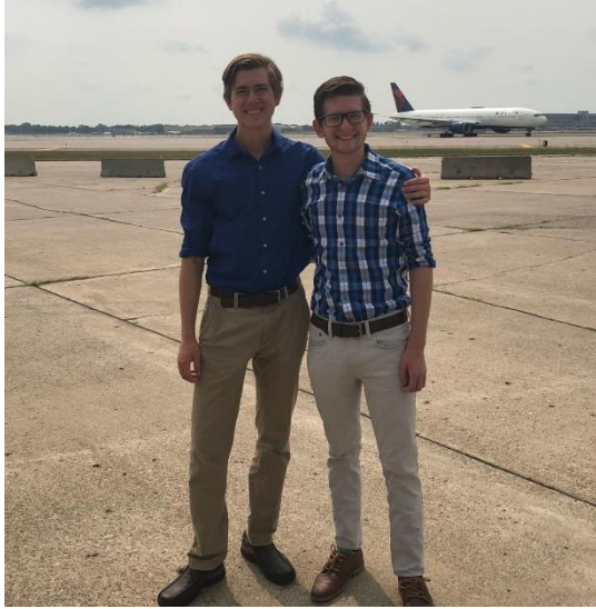
General Mitchell International Airport Tour

In the past year, the UW-Milwaukee chapter activities have included traveling to district meetings, having scheduled chapter meetings, hosting guest speakers, and attending the student leadership summit in Minneapolis. Our main goals for this year were to increase the club's involvement and increase the club's membership. By achieving these goals, we would be