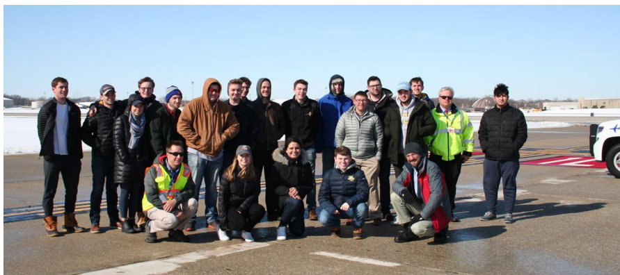
General Mitchell International Airport Tour

https://www.eng.mu.edu/~drakopoa/ite/MU_chapter/chapter.htm