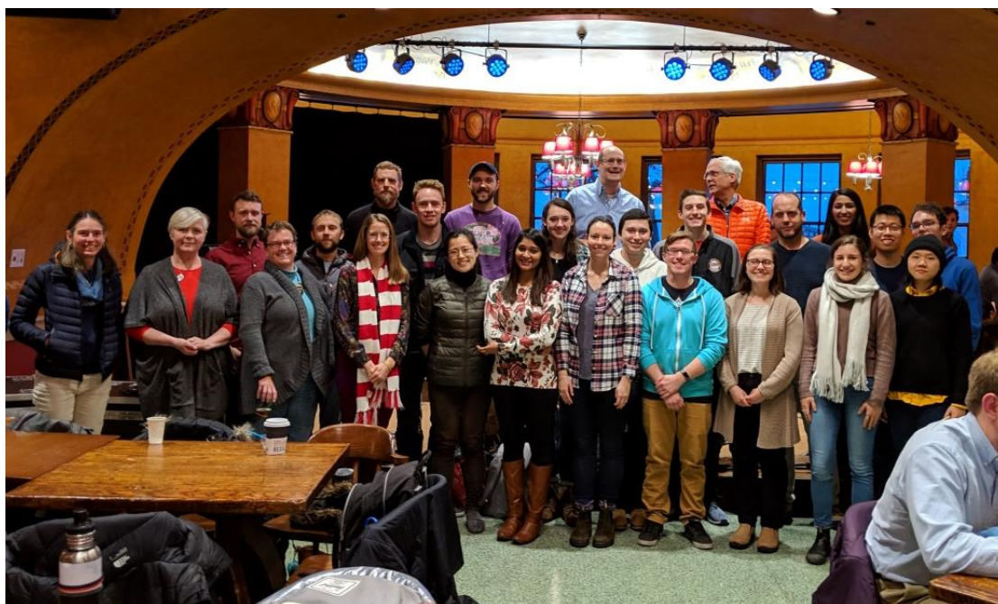
Ice Cream Social Joint Event with Urban Planning and ITE Chapter

Additionally, we have had several social events, most recently, an ice cream social where our student chapter met up with other students interested in transportation across the campus, from urban planning students to engineers, business, and sociology students (shown below).