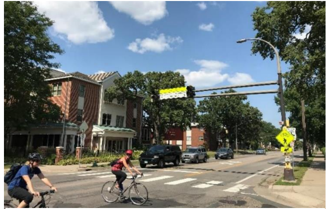
Actuated Flashing Yellow and Red Beacons